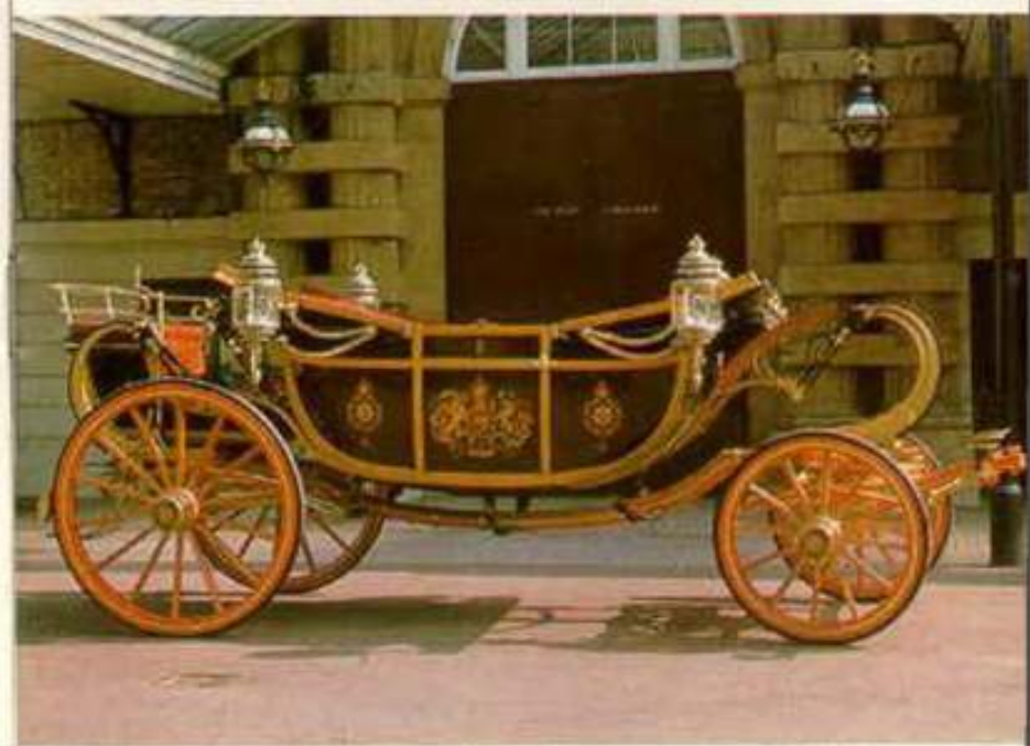
Above: The Glass Coach, with coachman and footmen wearing State Livery. Facing page: The Scottish State Coach (above), and (below) the 1902 State Postillion Landau.